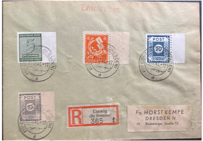
Typical post WW2 East German cover for collector w/ variety

with special or unique stamps. A German cover from 1872, with writing I can't read is interesting. There are the letters addressed to a Mr. Parish, from milling manufacturers and grain suppliers, obviously before the establishment of