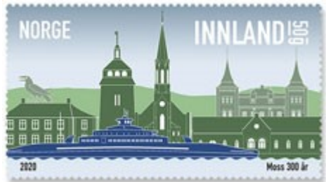
2023 stamp of Norway

It is a sweet sound to hear the range of tones that exceeds the ears capabilities and those notes that you don't need ears to feel as your body vibrates.